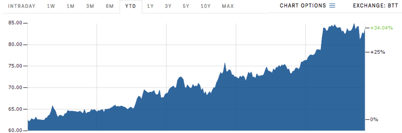
Chart Of Gbp To Usd Download Free For Windows 10