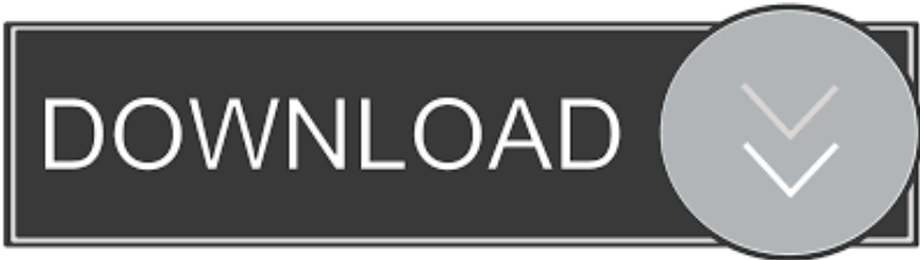
Chart Of Gbp To Usd Download Free For Windows 10